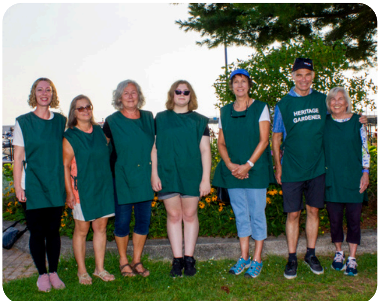
Bed 5 Forget-Me-Nots