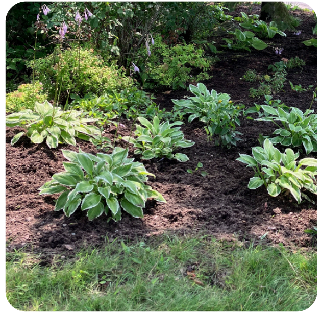
Bed U2 Dirty Dozen